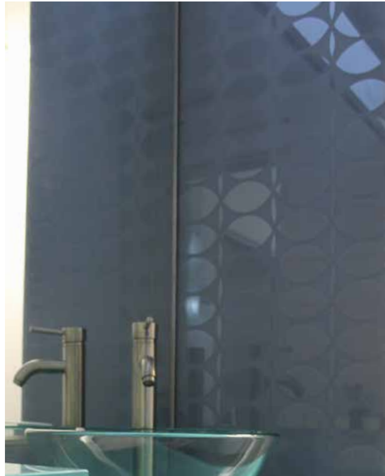
Custom etched panels on charcoal backpainted glass (4mm)