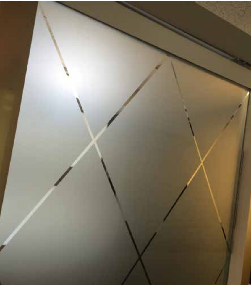
Custom etched door insert on clear glass with negative etch pattern.

Custom etched glass by Element Designs adds interest to your designs by transforming ordinary clear or backpainted glass into extraordinary custom design surfaces. Our ability to etch clear or backpainted glass opens the door to a world of unique applications such as door inserts, wall panels, privacy panels, tabletops, signage and more. Element Designs can utilize most customer provided high resolution images in their proprietary etching process.