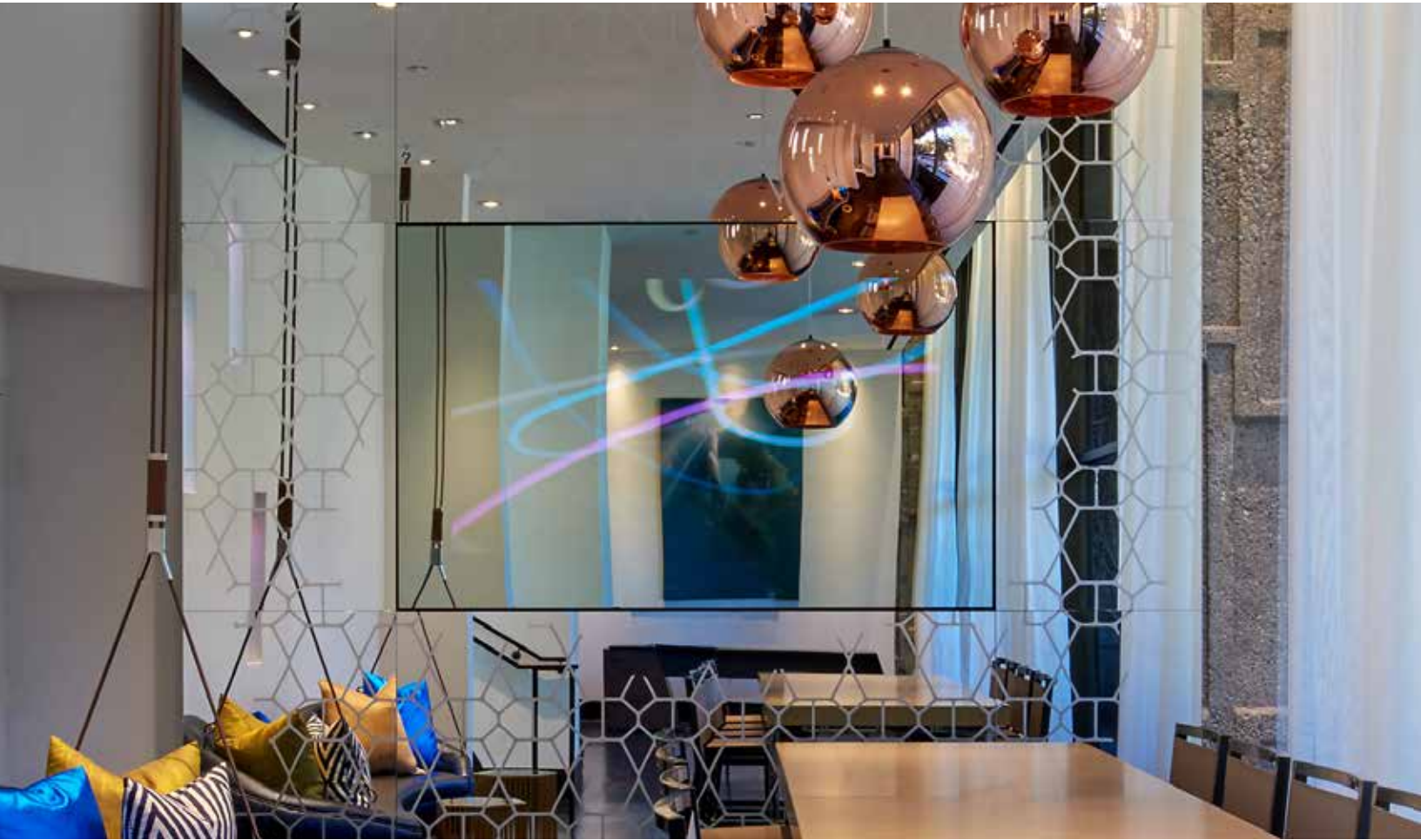
Wall panels with custom etched pattern on mirror glass. Project by Dawson Design Associates.