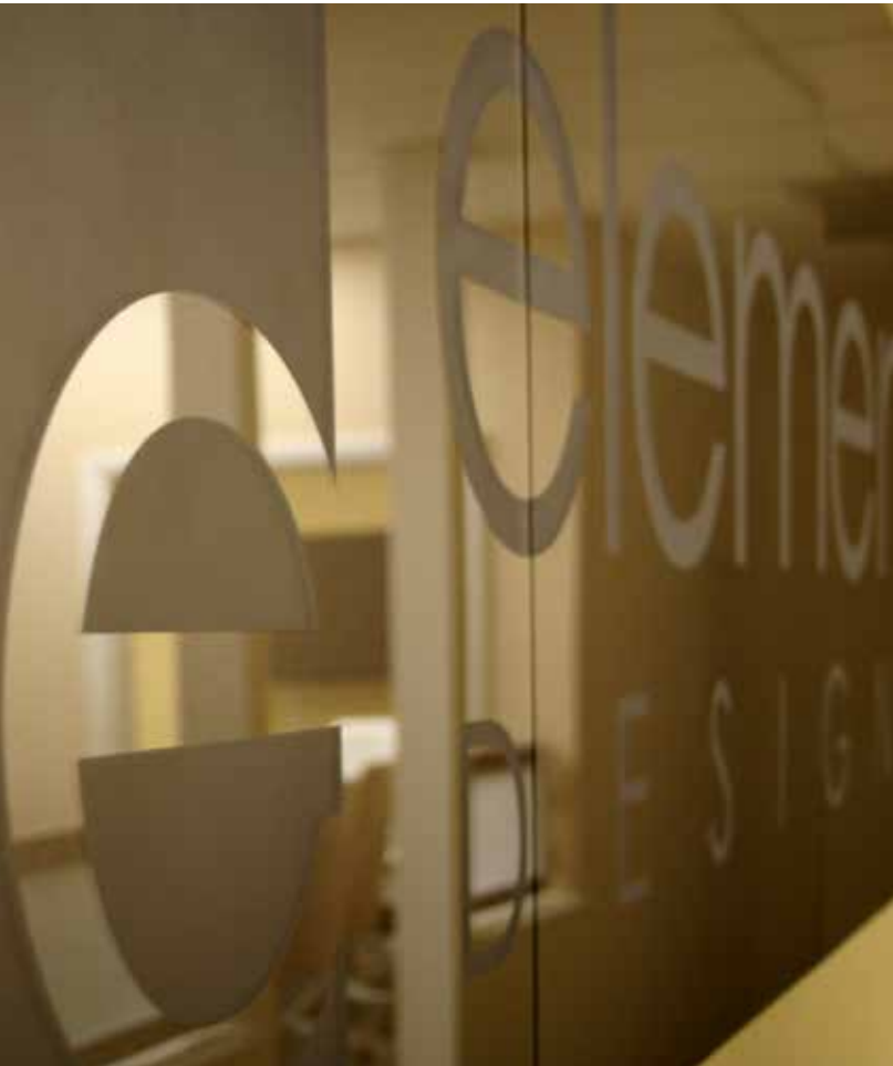
Custom etched backpainted glass signage in bronze (4mm)